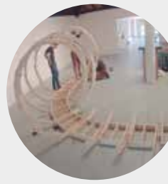
pentagonal prism 2013